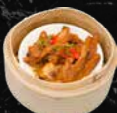
D7 豉汁鳳爪 Fong Djau Black bean chicken feet Zwarte bonen kippenvoetjes