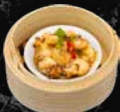
D12 沙茶太子尤 Sacha baby squid Shacha baby inktvis