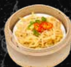
D20 薑蔥牛柏葉 Tripe with ginger & spring onions Rundermaag met gember & lenteui