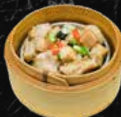
D6 芋頭豉汁排骨 Pai Gwut Black bean spare ribs with taro Zwarte bonen sparerijs met raro