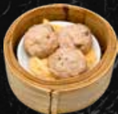
D5 山竹牛肉 Beef meatball with bean curd skin Rundergehaktbal met sojabonenvel