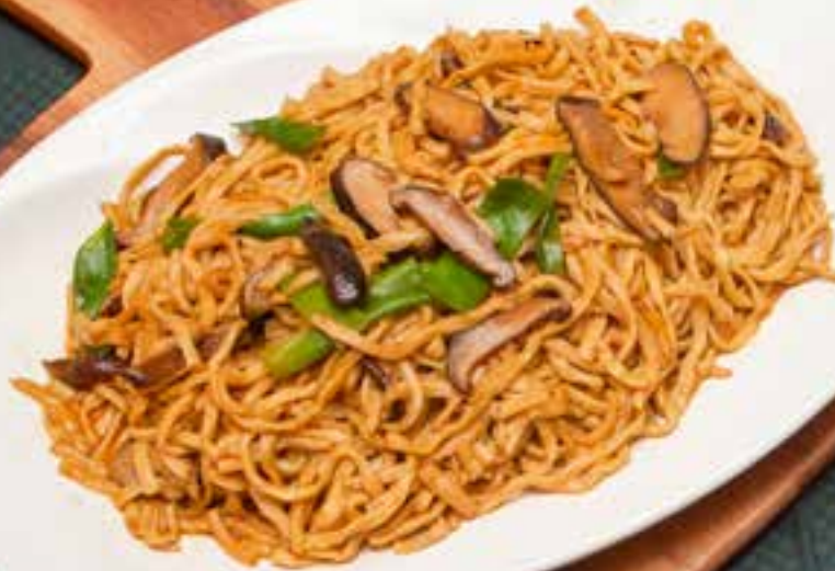
D271 黑松露醬燒什菇伊麵 22,50

Yi min is often consumed on birthdays, as it is generally referred to as Longevity noodles or Sau mein.