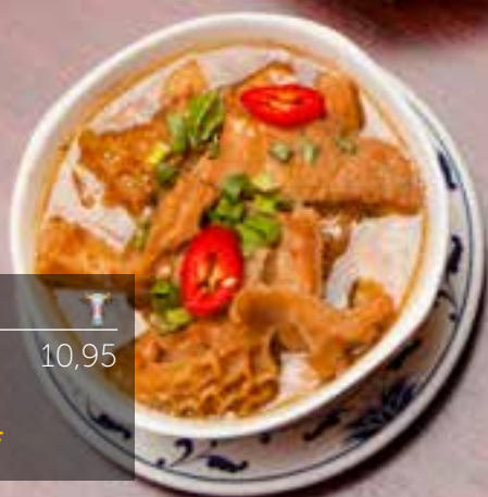
D15 牛什盅 Beef organs stew Runderorganenstoof